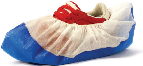
Shoe Cover Dimensions