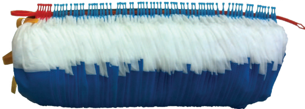
Bundle of Booties

Shoe Cover Refills for KineticButler Automatic Shoe Cover Dispensers