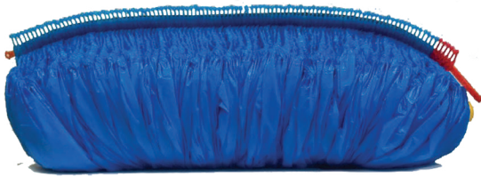
Bundle of Booties

Shoe Cover Refills for KineticButler Automatic Shoe Cover Dispensers