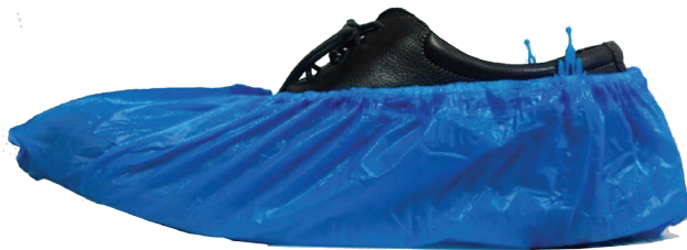
Shoe Cover Dimensions