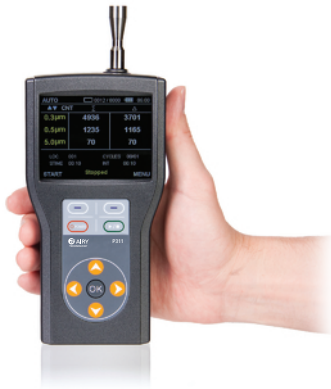
Only 1.26 lbs