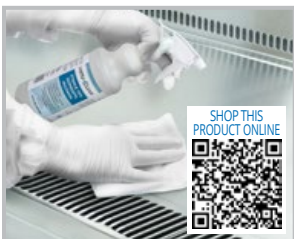
Virtu-Clean™ Sterile 70% Isopropyl Alcohol