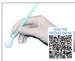
Virtu-Clean™ Class 100 Nitrile Cleanroom Gloves